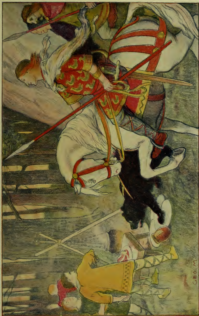
SIEGFRIED WITH THE BEAR.